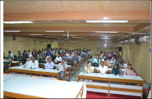
Students participating in the event